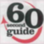
Your quick-five guide to the week ahead Page 20