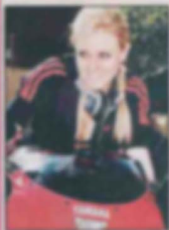
Touch of glamour: Rouge is decked out Music - Page 13