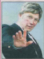
Managing laughter: Salthum goes Doolally Theatre - Page 15